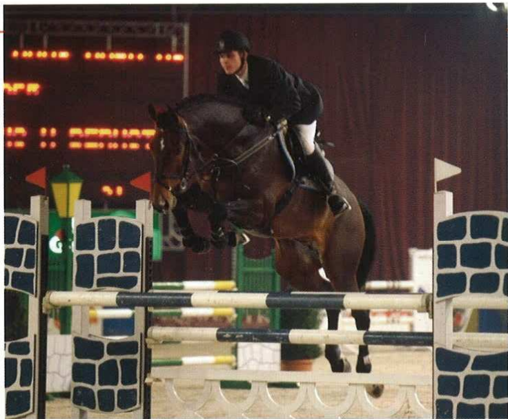
The approved stallion Van Gogh was the 2005 Overall Performance Champion in Ermelo.