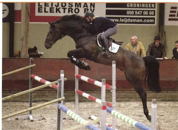
Warrant was registered last spring. He finished the performance test with the highest scores for jumping.