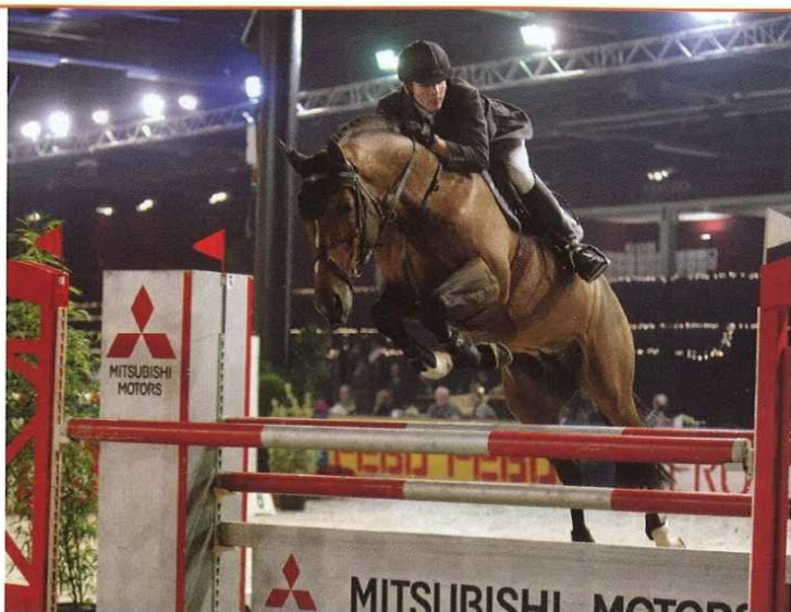
Vincenzo was the Stallion Selection Champion of his birth year in 's-Hertogenbosch.