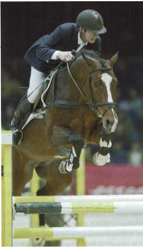
The approved KWPN stallion Padinus (s. Heartbreaker ) died in 2005.