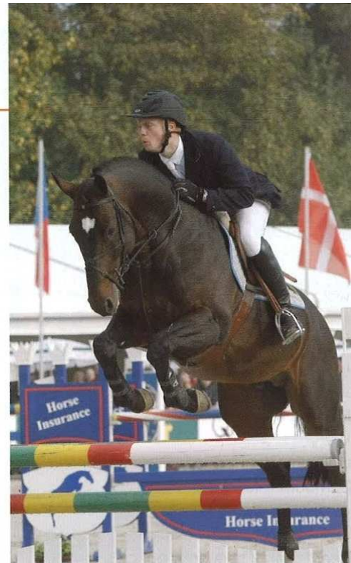
Heartbreaker 's KWPN approved son Upgrade .